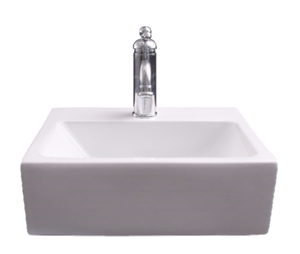
Faucet not included