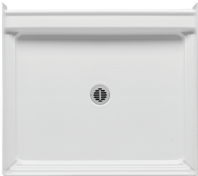
Shown with optional brass drain assembly.