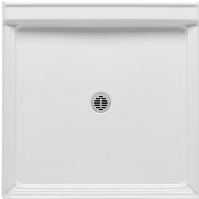
Shown with optional brass drain assembly.