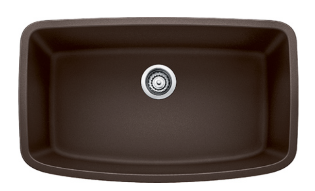
Model 441613 shown