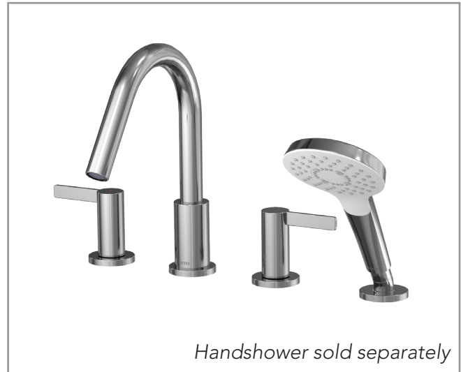
Handshower sold separately