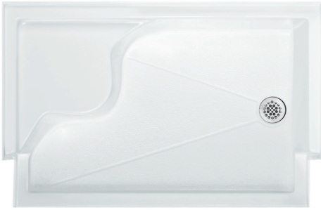
Shown above with right-hand drain.

Material - Acrylic CXL™ Shipping Weight - 100 lbs / 45 kg Threshold - Low-Profile, Seated Drain Location - End Floor - Textured