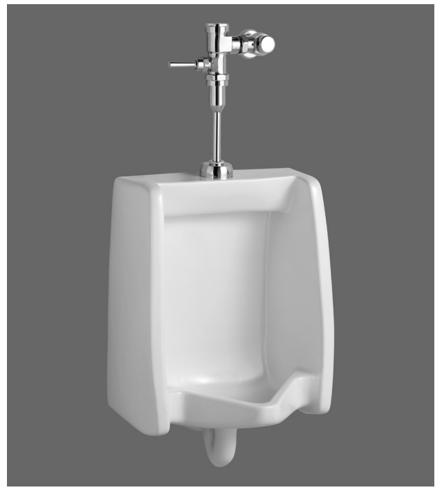
SEE REVERSE FOR ROUGHING-IN DIMENSIONS