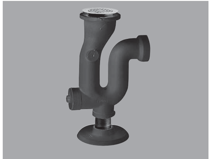
7798.020 / .030 IS FOR ENAMELED IRON SERVICE SINK