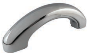
Standard Grab Bar